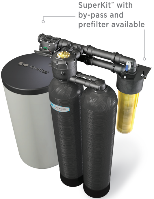
Model Shown: S250