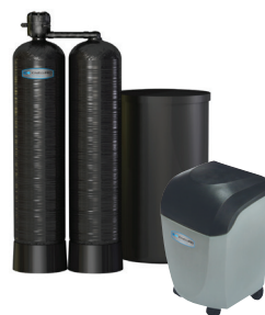
POE & POU Water Softeners

KineticoPRO™ offers a complete range of commercial water treatment solutions. Based on a per-location water analysis, we will work with you to prescribe the ideal water filtration, softening, and reverse osmosis solutions to optimize your water quality and protect your equipment.